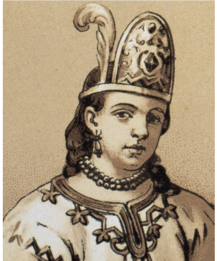
Figure 3. “Malinche (c.1496-1529). Engraving,” artist unknown. Malintzin is featured with a headdress and her floral huipil.