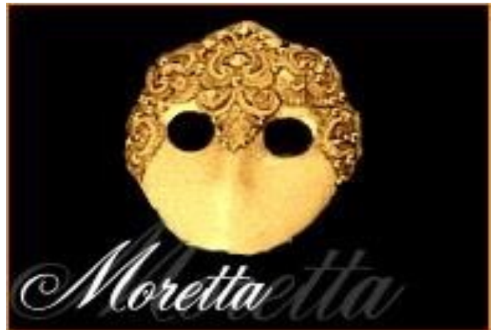
History of Venetian Masks. (n.d.). Retrieved October 22, 2020, from http://magicofvenezia.com/history-of-venetian-masks/