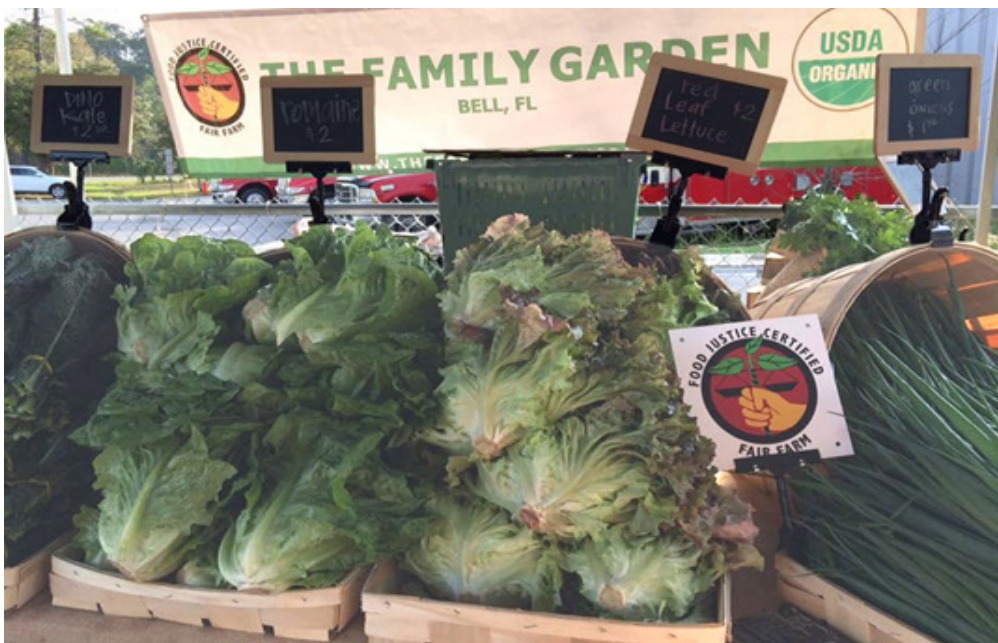
Image 2, Fresh produce displayed on a table at a farmers market, featuring the Food Justice label.

workers, who can afford transportation, as well as housing near the gardens. Lastly, the long hours spent in the fields may not leave enough time for transportation and working on the garden, or even the required 2 monthly hours spent on common projects (Mesa Verde Gardens). While farmworker gardens may play a role in increasing food security for a select group, their inherent exclusion and stifling of collective action means that they are unable to broadly increase food security.