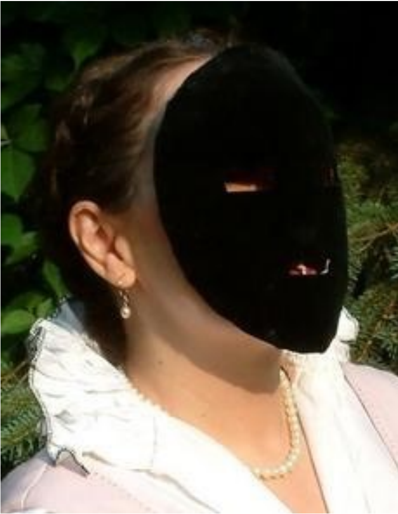
A 16th Century "Vizard" Mask. (n.d.). Retrieved October 22, 2020, from http://www.houseffg.org/belphoebe/Research/Masks/Index.html

mistaken for a nobleman — or vice versa" (History of Venetian Masks). Furthermore, masks gave people a new found confidence to say what they felt without fear of retribution. The concealment of one's identity permitted a greater sense of freedom because, "with no faces, everyone [has] voices" (History of Venetian Masks). Shakespeare took advantage of this unique nature of masks in many of his plays. He used the deceptive and concealing nature of masks to suggest their ironically liberating qualities.