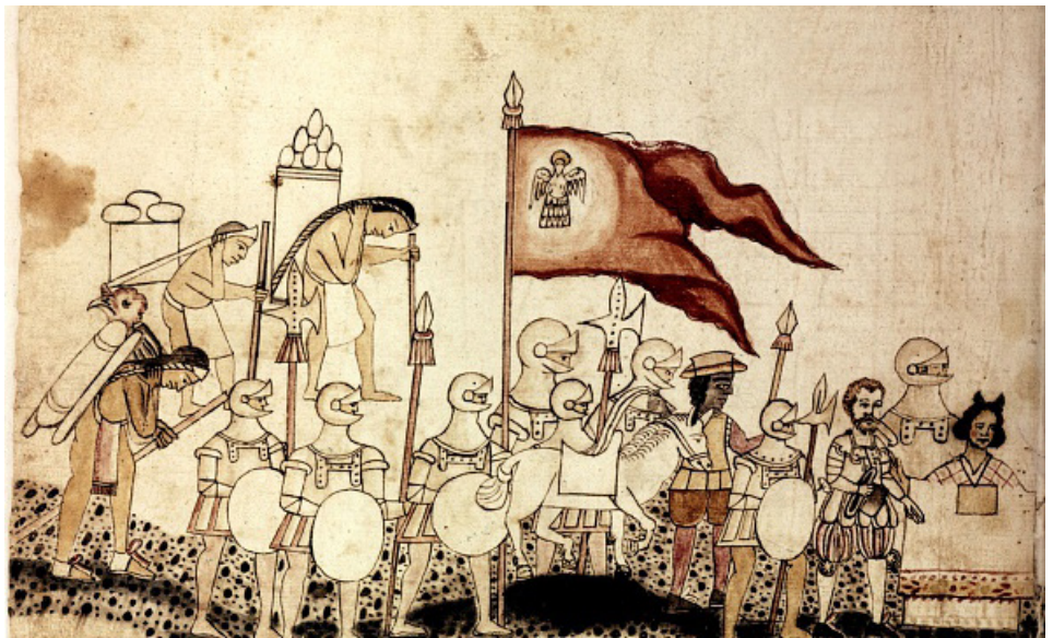
Figure 2. “Cortés arriving in Mexico, 16th century,” from The Codex Azcatitlan , artist unknown. Malintzin stands to the side of Cortés leading the conquistadors through Mexico.

While this process of narrative reclamation through magic may seem like a novel literary movement at first, it is important to recognize the long standing tradition of storytelling decolonial writings tap into in order to compose their works. To understand why this