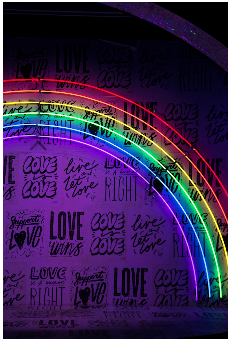
Rainbow Lights

School of Law examined the results of a Gallup Daily Tracking Survey and found that 4.5% of a sample of