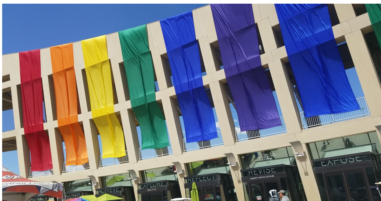
SLC Library

Recognizing and respecting the language of identity is crucial to the well-being of members in the LGBTQ+ community. Identities are closely linked to self-image and self-worth, and when those chosen labels are invalidated or discriminated against, it can cause physical and mental distress. LGBTQ+ teens are twice as likely to attempt suicide as straight adolescents, according to the Centers for Disease Control (LGBTQ Youth). However, risk factors for suicide