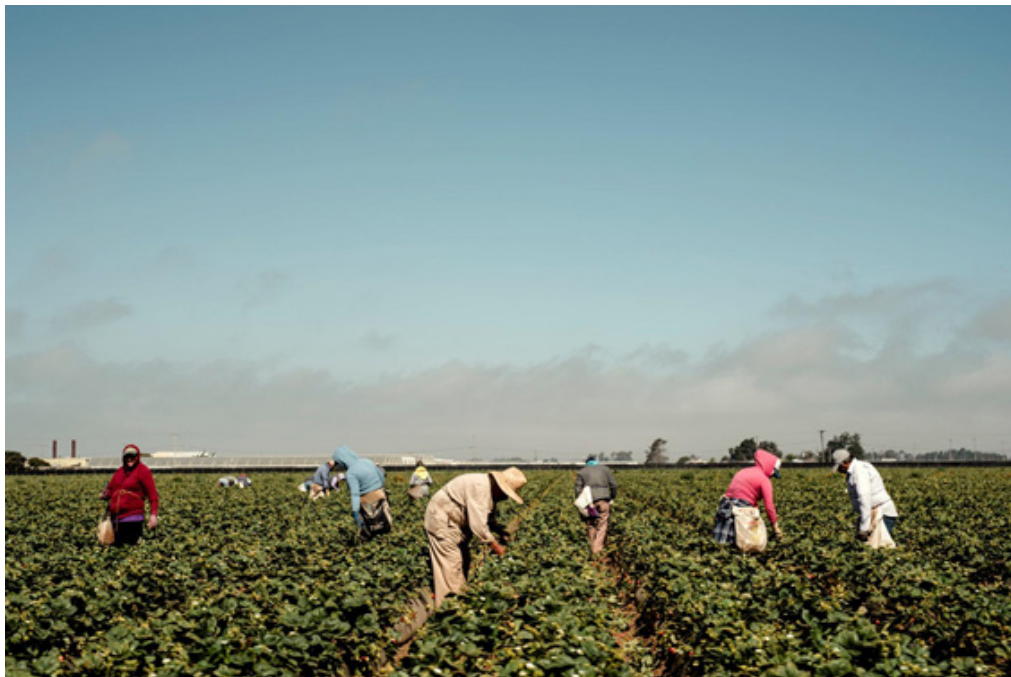
Migrant laborers pick strawberries in California’s Salinas Valley.