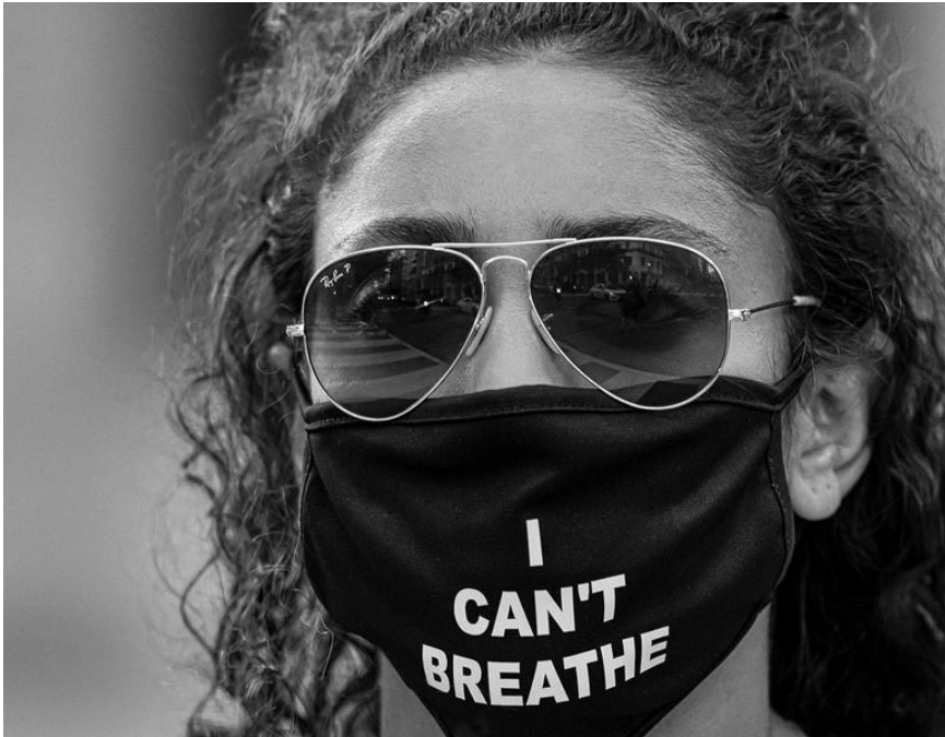
Humanities, S. (n.d.). The meanings of masks. Retrieved March 27, 2021 from https://news.mit.edu/2020/meanings-of-masks-shass-series-0924

gests that masks are ironically freeing tools that allow one to achieve his or her desires. Therefore, there are more benefits to wearing a mask today than just protection against and prevention of the coronavirus. Masks provide the same sense of freedom and liberation as they did to Romeo and Juliet . Furthermore, the customization and variety of masks today allows people to express themselves and their identities. While the times and circumstances for wearing masks are different now than in Shakespeare's day, their advantages have remained the same.